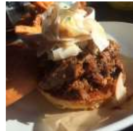
The Smoked Barbeque Pork Shoulder sandwich.