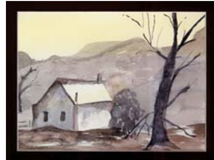
Water Color --- Ardis Moomey

A SHOW OF RIVERBEND ARTISTS OCTOBER 2016 All Artists Welcome